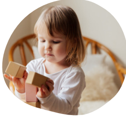
Baby Dragons 12-24 Months