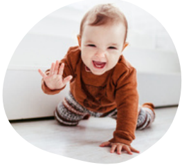
Hatchlings 6-15 Months