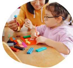
Dragon Flight 36-48 Months