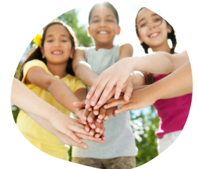
Black Dragons 8-10 Years

As every nursery provision in the U.K., we deliver the developmental outcomes established in the Early Years Foundation Stage across 7 areas of learning.