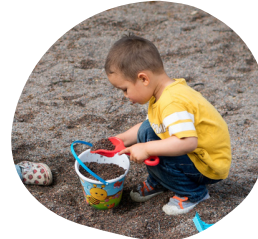
Red Dragons 5-6 Years