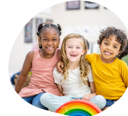
Gold Dragons 6-8 Years