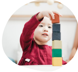
Blue Dragons 22-36 Months