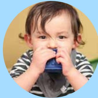
Hatchlings 6-15 MONTHS