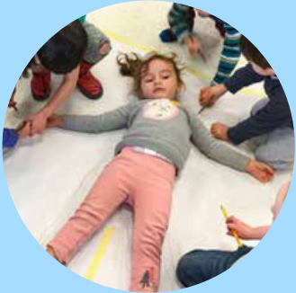
Dragon Flight 36+ MONTHS