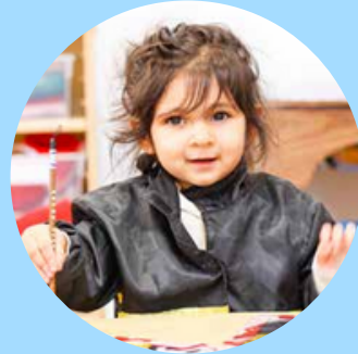
Blue Dragons 22-36 MONTHS