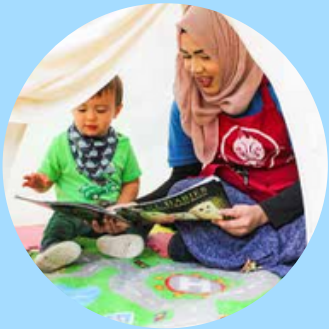
Baby Dragons 12-24 MONTHS