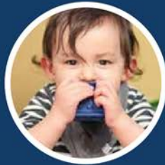
Hatchlings 6-15 MONTHS