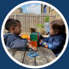
Blue Dragons 22-36 MONTHS