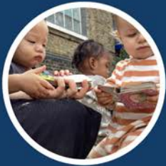
Baby Dragons 12-24 MONTHS