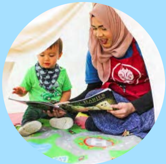
Baby Dragons 12-24 MONTHS