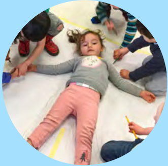
Dragon Flight 36+ MONTHS