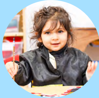
Blue Dragons 22-36 MONTHS