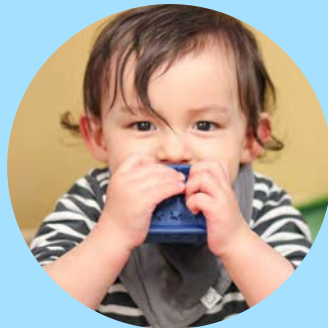
Hatchlings 6-15 MONTHS